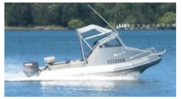
OCEAN CRAFT 5200 Chinook 5.2 Metre Cuddy Cabin