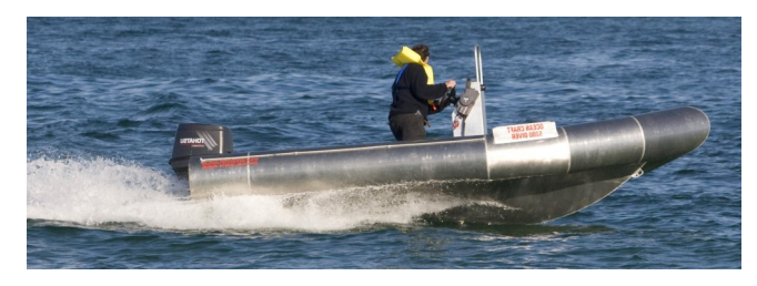
PLATE ALLOY OCEAN CRAFT Which means that your OCEAN CRAFT is guaranteed never to sink lifetime warranty - isn't that what you call reliability!? And did we say super stable and fast!? Experts are using strong language to describe the Ocean Craft as the safest boat ever built - because as well as being phenomenally buoyant lightweight and strong—You and your OCEAN CRAFT plane along on a cushion of air meaning unsurpassed comfort in ride and fuel economy using OCEAN CRAFT's POSI LIFT hull

If you're already familiar with the capabilities of the proven inflatable style design of a rubber dinghy you'll already know a lot about the performance, safety and reliability of today's ALL ALUMINIUM